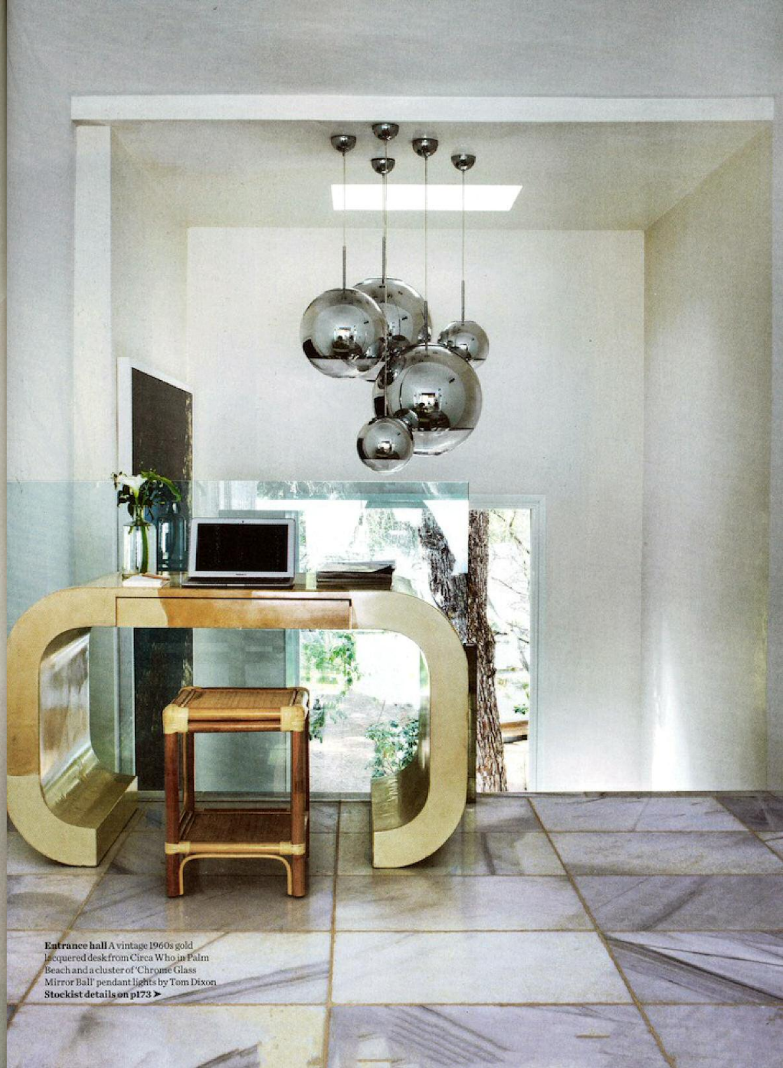
Entrance hall A vintage 1960s gold lacquered desk from Circa Who in Palm Beach and a cluster of 'Chrome Glass Mirror Ball' pendant lights by Tom Dixon Stockist details on p173 >